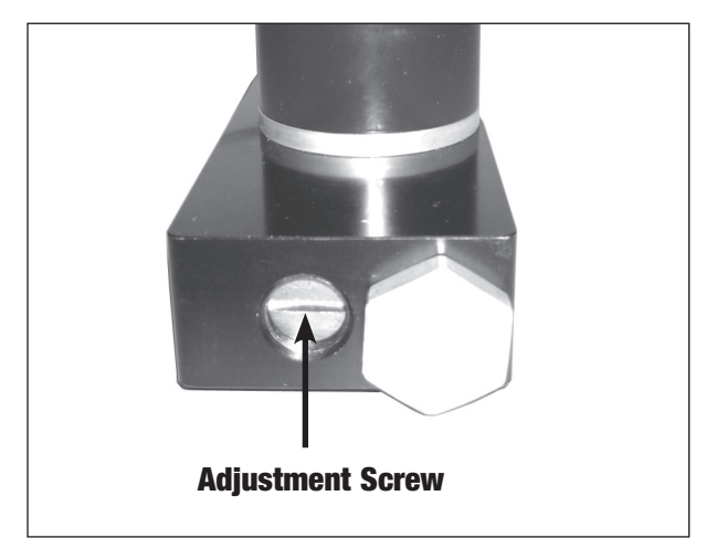
Figure 3 - Fuel Pressure Adjustment